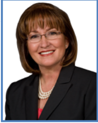
Orange County Mayor Teresa Jacobs